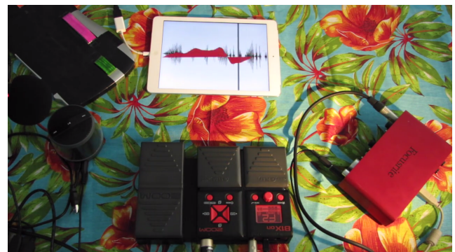
Figure 1: The Voice Reaping Machine.

Despite this relevance, designing for playfulness remains a challenging task, as little knowledge is available for designers to support their choices. For example: in case we want to design a playful NIME, how should we proceed? How can we make sure we are properly addressing playfulness in our design? In other words, what kind of design decisions should one make so that the resulting NIME is playful?